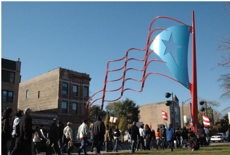
Figure 5. No Se Vende march going through the flags of steel in Humboldt Park erected under the leadership of Alderman Billy Ocasio.