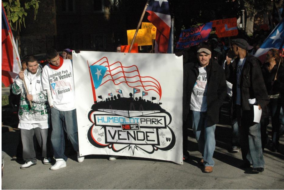
Figure 4. No Se Vende Campaign sign being held by youth at the 2006 housing submit.