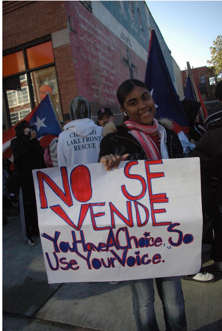
Figure 2. Youth community organizer holding a sign at a manifestation after a housing submit that took place on Humboldt Park on April 2006.