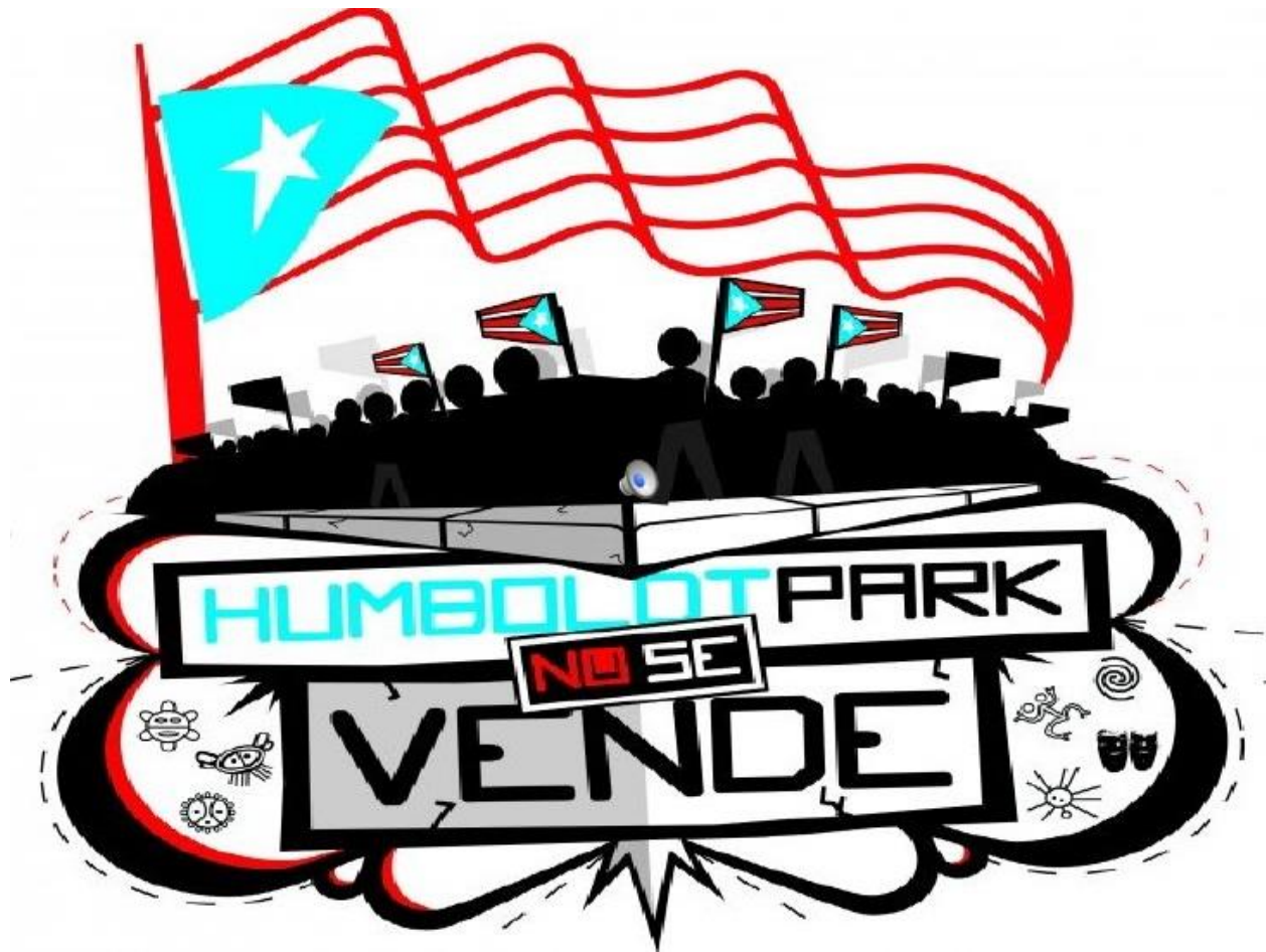
Figure 3. No Se Vende Campaign image showing the flags of steel erected in 1995 acting as a fortress protecting the neighborhood from being sold to outsiders.

again and this strategy helped increase the level of trust between organizers and residents. Activists also sought to influence electoral politics but they were funded by the Puerto Rican Cultural Center not by politicians like Ocasio.