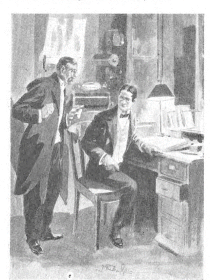
— & Qué vas á hacer con eso? &Es una vergüenza para un ingeniero como tú!

ternura, sintiò, al saberlo todo, un inmenso agradecimiento kucia el pobre gran hombre que babia sacrificado su felicidad por dar vida a una desconocida. Su agradecimiento había llegado muy pronte al nois extrenado amor. La jove, en una convulsión entera de su cuerpo, oprimió centra en loca la mano de Sivel, Pero éste la retiró vivamente. —; No. no! Levántese.—le dijo, mientras allá en el fondo de su corazón la gran heritad de su amor se reabría ante aquella presencia amargamente evecadora... —; Perdón! [Perdón!...—sollezada la jov.n. de rocidilas siempre. —Si no tengo unda que perdonarle,—tuvo faerzas Sivel para sonreires.—Pero levántese. —No. no... Yo tengo la culpa... Sivel tuvo entonces la sensación de que una mano indiferente, una mano cualquiera, estaba arañando su cirazón. Su dolor era suyo y no de aqueina extraña. —; Perdón!...; Vo tuve la culpa!... Fué por mi... —; Ab. no! Le pido perdón á mi vez.—exclamó Sivel. No lo hice por ustel! me compaderi de su ser, de una existancia condenada á morir, como la suya, de su vida, en fin... pero no de usted, joh no!