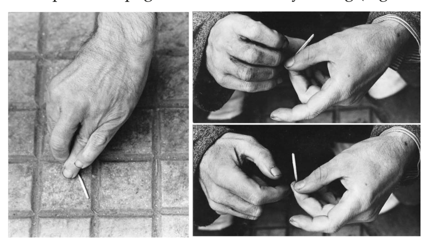
Fig. 4: Luciano D'Alessandro, two pages from Gli esclusi, pp. 18 and 19.

same person. These rub each other, hold each other, are in the position of prayer with outstretched or interlaced fingers (e.g. pp. 43, 47, 55). Alternatively, they are depicted in gestures of suffering, anxiety or are contracted (e.g. pp. 33, 76, 79). Only in two cases hands are depicted in communicative gestures (pp. 32, 52) or in the act of writing (pp. 13, 14-15). The spread at pp. 30-31 is particularly striking as it depicts old, wrinkled, hands that play with a crumpled scrap of newspaper: a visual simile that associates the inmate with waste, 'dumped' in the asylum like garbage is dumped in the bin. Also the sequence at pages 18 and 19 is very telling (Figure 4).