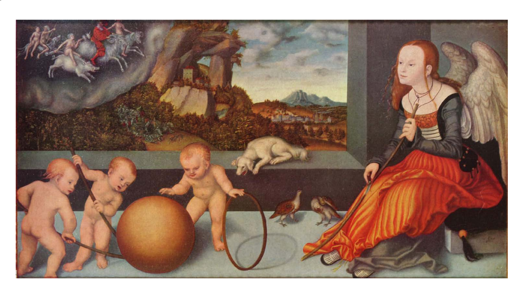
Fig. 5: Lucas Cranach, Melancholie, Oil on Panel, 1532. Public Domain.

It depicts hands that pick up a used match from the ground and play with it, evoking the 'staff of madness', a ubiquitous visual prop associated with fools and madmen (see Sforza Tarabochia 2021) that often appears in representations of melancholy. This is the case for instance in Lucas Cranach's 1532 painting Melancholia , in which an angelic woman casts an empty gaze towards playing putti while distractedly carving her thin stick (Figure 5).