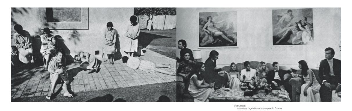
Fig. 7: From Morire di Classe, pp. 26-27

Pages 26 and 27 are another peculiar combination, that exemplifies both the narrative and the protocinematographic approaches (Figure 7).