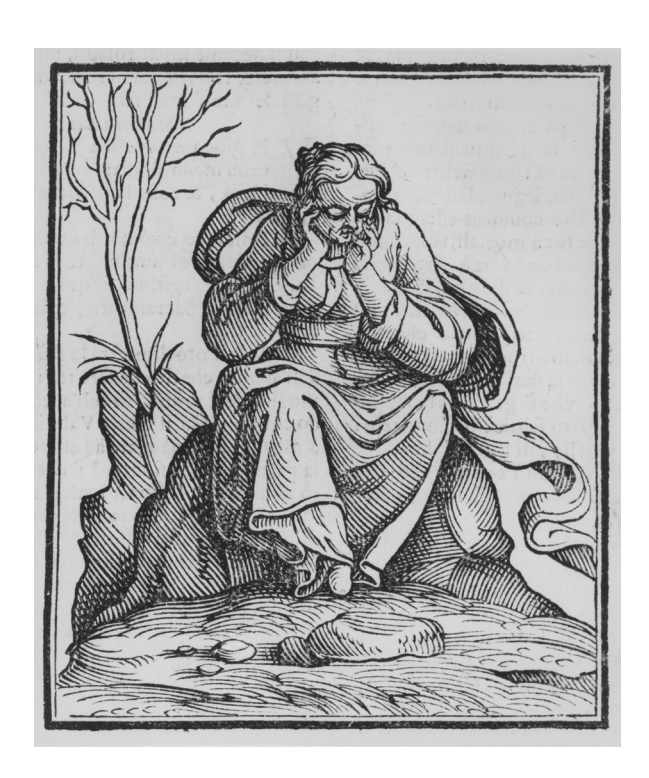
Fig 2: Malinconia from Cesare Ripa, Iconologia, p. 384. Woodcut, Public Domain.

presenti, e reali, il che mostrano i segni della mestizia, e del dolore. È mal vestita, senza ornamento. (Ripa 1645: 384) (Figure 2)