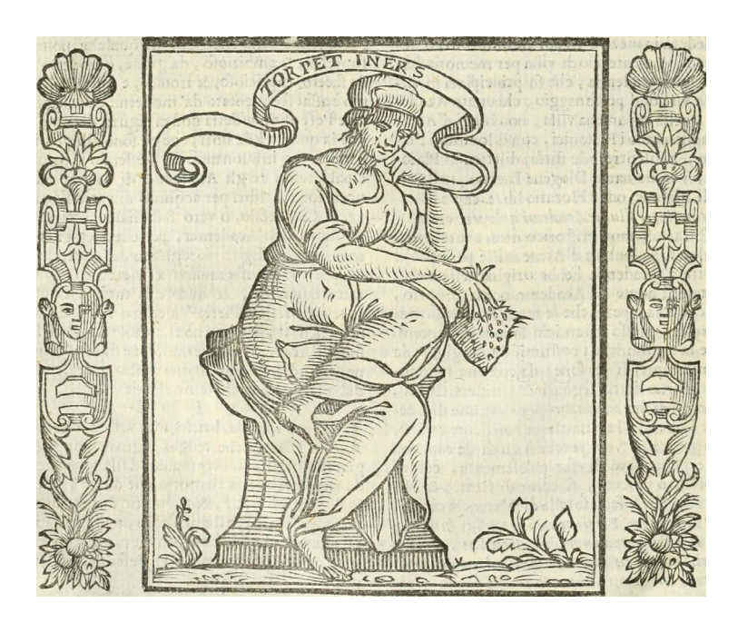
Fig 3: Accidia from Cesare Ripa, Iconologia, p. 6. Woodcut, Public Domain.

same person. These rub each other, hold each other, are in the position of prayer with outstretched or interlaced fingers (e.g. pp. 43, 47, 55). Alternatively, they are depicted in gestures of suffering, anxiety or are contracted (e.g. pp. 33, 76, 79). Only in two cases hands are depicted in communicative gestures (pp. 32, 52) or in the act of writing (pp. 13, 14-15). The spread at pp. 30-31 is particularly striking as it depicts old, wrinkled, hands that play with a crumpled scrap of newspaper: a visual simile that associates the inmate with waste, 'dumped' in the asylum like garbage is dumped in the bin. Also the sequence at pages 18 and 19 is very telling (Figure 4).