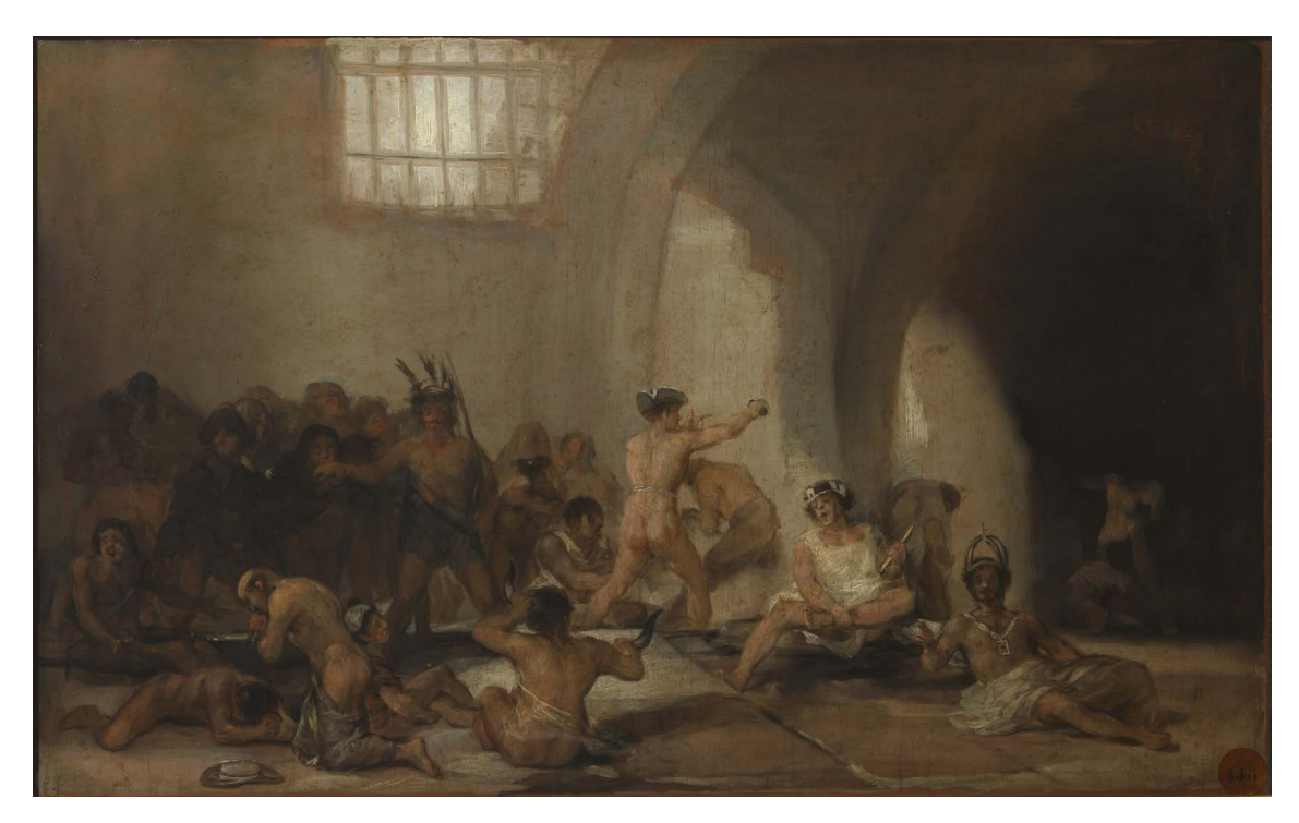
Fig. 8: Francisco de Goya, La casa de locos, Oil on panel, 1812. Public Domain.

Gli esclusi focuses on the signs that madness and internment in the asylum leave on the bodies of inmates – expressions, gestures, posture. In Morire di classe the signs of madness and segregation are external, to emphasise the marginalisation of inmates and their social conditions of being rejects of society – «relitti, bucce di uomini» says Rilke in his Quaderni as quoted in Morire di classe. Numerous photographs are taken from behind a fence (e.g. p. 16), gate (e.g. p. 59) or bars (e.g. p. 61). Images often reveal tall (and decrepit) walls behind the inmates (e.g. p. 15). The condition of madness is that of being caged or imprisoned, segregated, marginalised. In his paintings, Goya had already used a similar strategy of visual composition to convey a comparable meaning. For instance, in La casa de locos (1812-1819)