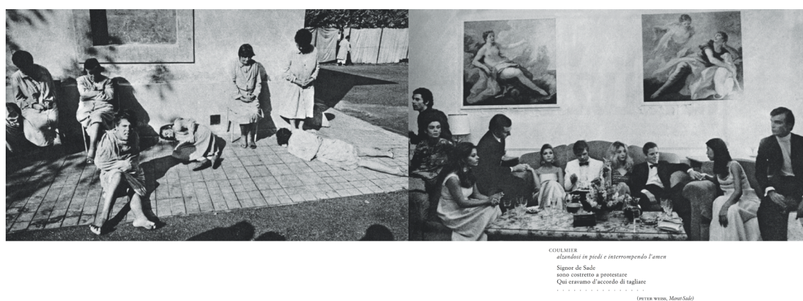
Fig. 7: From Morire di Classe , pp. 26-27

Pages 26 and 27 are another peculiar combination, that exemplifies both the narrative and the protocinematographic approaches (Figure 7).