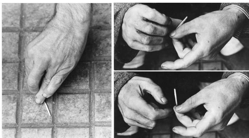
Fig. 4: Luciano D'Alessandro, two pages from Gli esclusi , pp. 18 and 19.

same person. These rub each other, hold each other, are in the position of prayer with outstretched or interlaced fingers (e.g. pp. 43, 47, 55). Alternatively, they are depicted in gestures of suffering, anxiety or are contracted (e.g. pp. 33, 76, 79). Only in two cases hands are depicted in communicative gestures (pp. 32, 52) or in the act of writing (pp. 13, 14-15). The spread at pp. 30-31 is particularly striking as it depicts old, wrinkled, hands that play with a crumpled scrap of newspaper: a visual simile that associates the inmate with waste, 'dumped' in the asylum like garbage is dumped in the bin. Also the sequence at pages 18 and 19 is very telling (Figure 4).