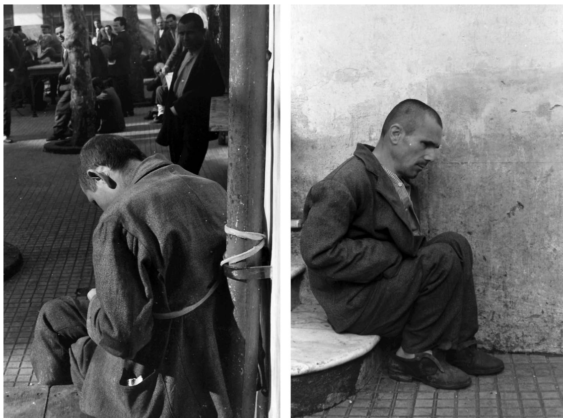
Fig. 1: Luciano D'Alessandro, two pages from Gli esclusi , pp. 6 and 7.

Their gestures and posture recall the traditional iconography of melancholy. The print Melancholia I by Dürer (1514), for instance, personifies melancholy as an angelic woman, sitting in the position of the thinker, her head leaning on the hand, gazing towards the emptiness beyond the frame. In his book of emblems, the Iconologia , Cesare Ripa describes melancholy as: