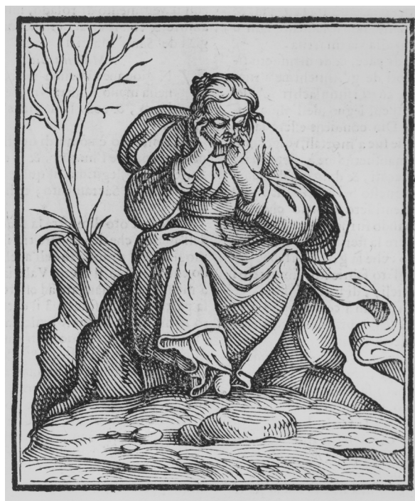
Fig 2: Malinconia from Cesare Ripa, Iconologia , p. 384. Woodcut, Public Domain.

presenti, e reali, il che mostrano i segni della mestizia, e del dolore. È mal vestita, senza ornamento. (Ripa 1645: 384) (Figure 2)