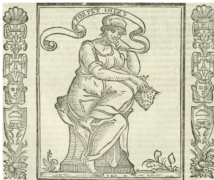
Fig 3: Accidia from Cesare Ripa, Iconologia , p. 6. Woodcut, Public Domain.

same person. These rub each other, hold each other, are in the position of prayer with outstretched or interlaced fingers (e.g. pp. 43, 47, 55). Alternatively, they are depicted in gestures of suffering, anxiety or are contracted (e.g. pp. 33, 76, 79). Only in two cases hands are depicted in communicative gestures (pp. 32, 52) or in the act of writing (pp. 13, 14-15). The spread at pp. 30-31 is particularly striking as it depicts old, wrinkled, hands that play with a crumpled scrap of newspaper: a visual simile that associates the inmate with waste, 'dumped' in the asylum like garbage is dumped in the bin. Also the sequence at pages 18 and 19 is very telling (Figure 4).