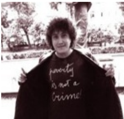
Fig. 7 "The Dissenters' Car Ride", 14 April 2007. http://nnm.me/blogs/assa82/v_moskve_proshel_avtoprobeg_make_love/ See video: https://vimeo.com/16046649