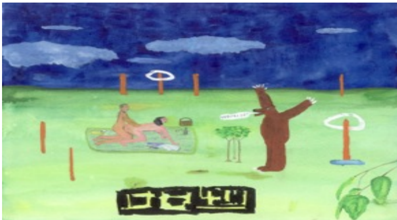
Fig. 13 The Meme "Hello, bear!" with Dmitrii Medvedev. See http://netspider.com.ua/index.php/2008/03/02/preved-medved/