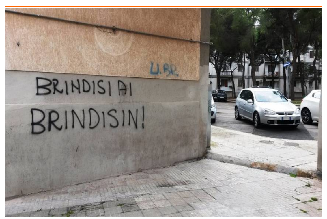
Brindisi to the Brindisians, graffiti in Brindisi, Italy.